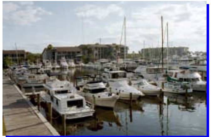
$565 million in retail sales are generated annually by the 407 marine related businesses identified in the county