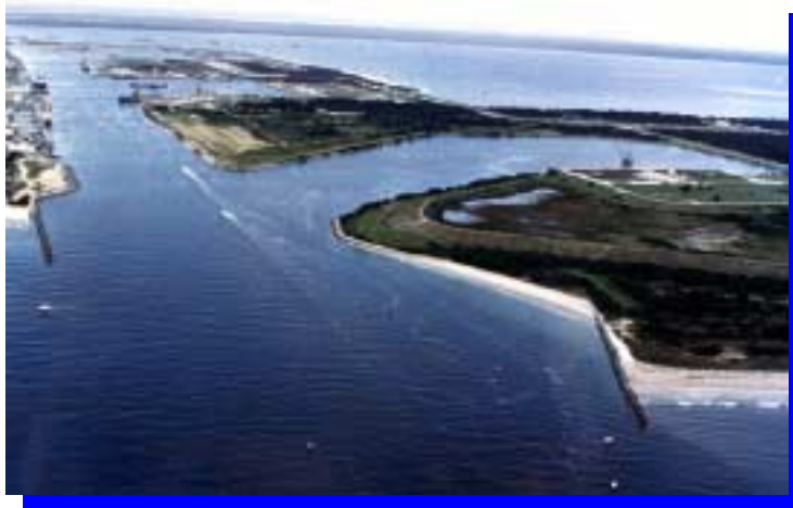
The Canaveral Inlet, pictured above with the Banana River in the background, is one of two inlets allowing boaters offshore access in Brevard County; the other, Sebastian Inlet, is located at the county's southern boundary.

Canaveral Inlet. The Banana River lies east of, and is connected to, the Intracoastal Waterway on its northern end through the Canaveral Barge Canal and on its southern end at its confluence with the Indian River at Dragon Point. The Sebastian Inlet, at the Brevard/Indian River counties line, is the other offshore access point for boaters in Brevard County.