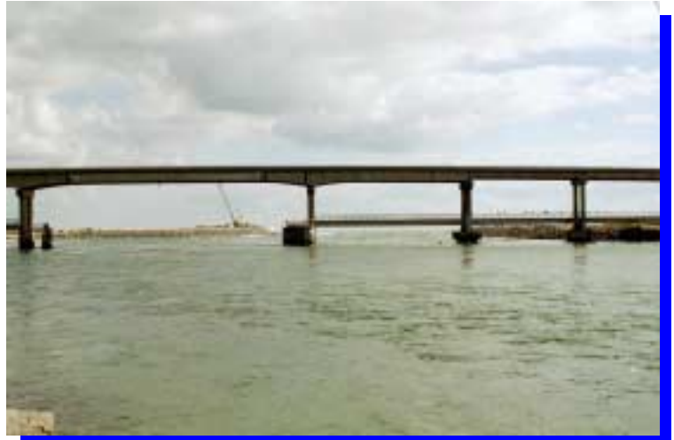
On an average year, $7.8 million is spent maintaining the Atlantic Intracoastal Waterway in Florida, including the dredging of ocean inlets such as Sebastian Inlet pictured above.

With reduced federal funding, the local sponsors of the nation's inland navigation systems are being required to shoulder a larger portion of the maintenance costs. For example, studies have shown that maintenance of the Atlantic Intracoastal Waterway Project in Florida requires expenditures of $7.8 million each year while federal funding remains at $3.2 million per year. The District has made a decision not to allow the waterways to deteriorate by deferring maintenance projects and has elected to fund this budgetary shortfall. This investment by the District may total up to $230 million over the 50-year planning period of the waterway. With such a large potential investment, the District needs to educate the general public as well as federal, state, and local public officials of the economic importance of expending these monies to meet the needs of the waterways.