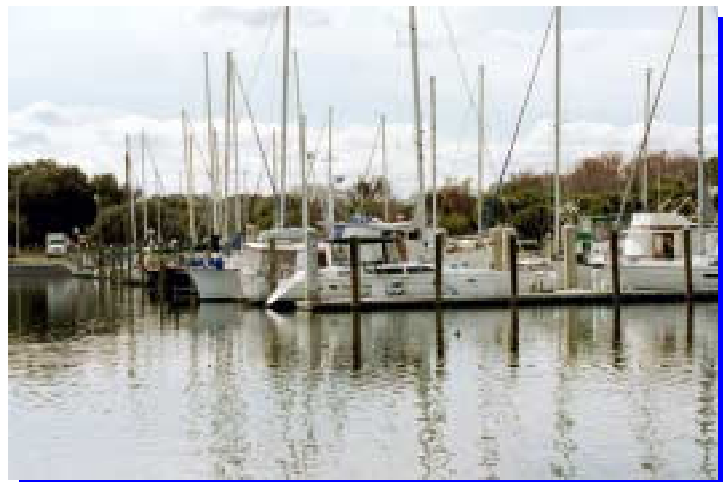
Without continual maintenance of the waterways, shoaling would prevent the use of the waterways by a significant portion of the pleasure craft in the county, such as the sailboats pictured

Based on the responses of businesses surveyed for this analysis, an average of nearly 73 percent of marine related business activity would be lost if vessel drafts were limited to three feet MLW. The largest impacts are expected in the manufacturing sector, followed by the retail trade sector, then by the service sector.