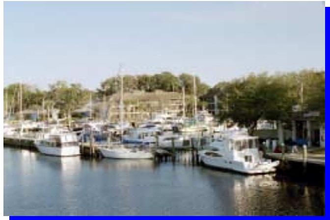
Marinas on the waterways are among the 50 firms in the county that generate $98 million in sales for marine related businesses annually