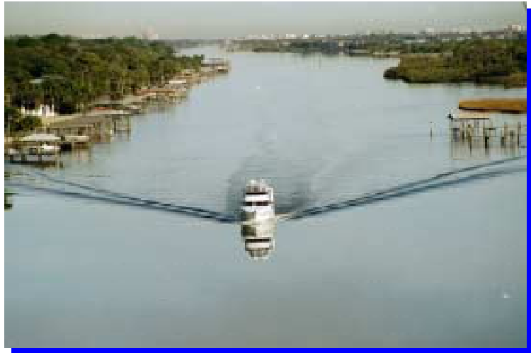
Maintaining the waterways within the District's 11-county area to allow the continuation of recreational boating activities will cost an estimated $7.8 million annually

With reduced federal funding, the local sponsors of the nation's inland navigation systems are being required to shoulder a larger portion of the maintenance costs. For example, studies have shown that maintenance of the Atlantic Intracoastal Waterway Project in Florida requires expenditures of $7.8 million each year while federal funding remains at $3.2 million per year. The District has made a decision not to allow the waterways to deteriorate by deferring maintenance projects and has elected to fund this budgetary shortfall. This investment by the District may total up to $230 million over the 50-year planning period of the waterway. With such a large potential investment, the District needs to educate the general public as well as federal, state, and local public officials of the economic importance of expending these monies to meet the needs of the waterways.