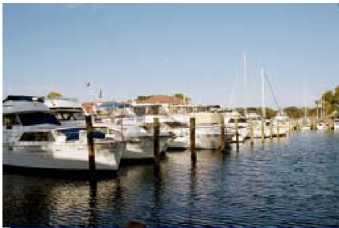
The waterways in Flagler County primarily serve the over 3,700 recreational boaters in the county.

between Trenton, New Jersey, and Miami, Florida. The Florida segment, which was completed in 1965, is 370 miles long and follows coastal rivers and lagoons past numerous tourism-oriented communities.