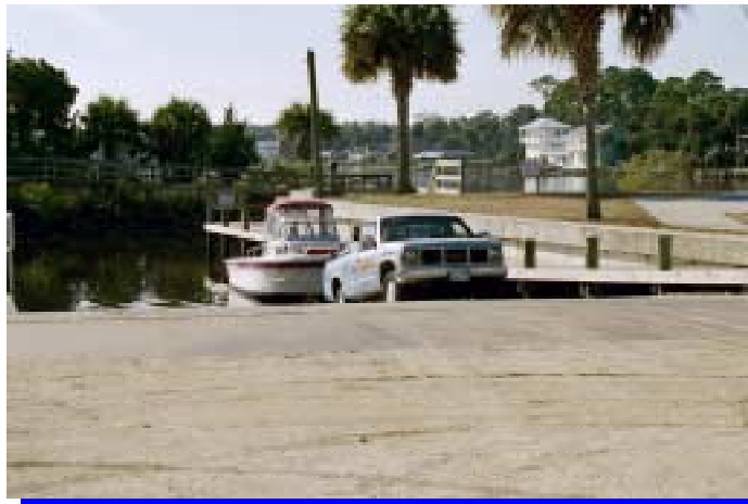
Recreational boating activity in Flagler County contributes a total of $133 million in sales, $46 million in income, and 1,116 jobs to the local economy

The current total economic impact of the waterways (marine related businesses and the purchase of non-marine related items) consist of $133.9 million in business volume, $46.6 million in personal income, and 1,116 jobs (Table 1).